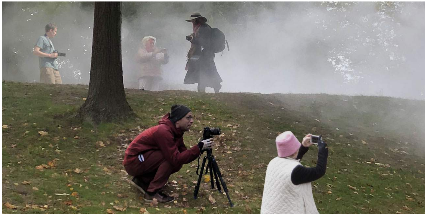
Collaborative photo shoot for the " Fog on the Greenway " Touchstone